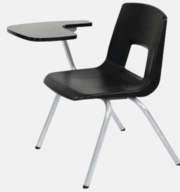
DuraStack Tablet Arm