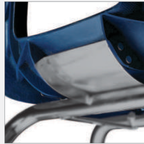
DuraStack Metal Support