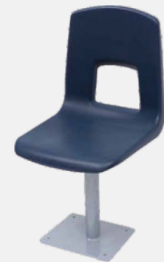
DuraStack Fixed Chair