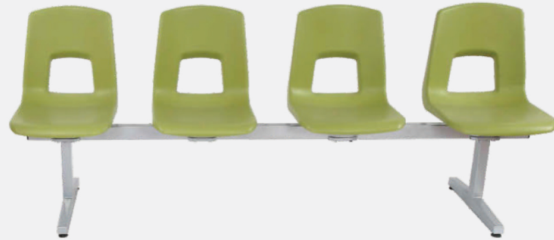
DuraStack Tandem Seating