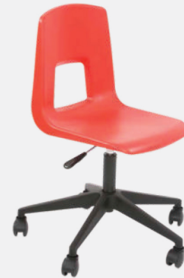
DuraStack Tablet Arm