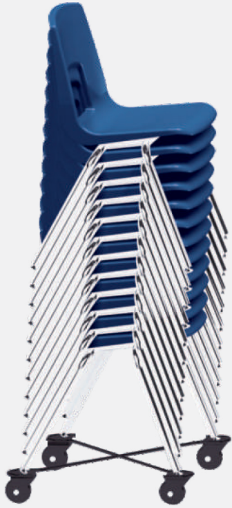
DuraStack on Dolly